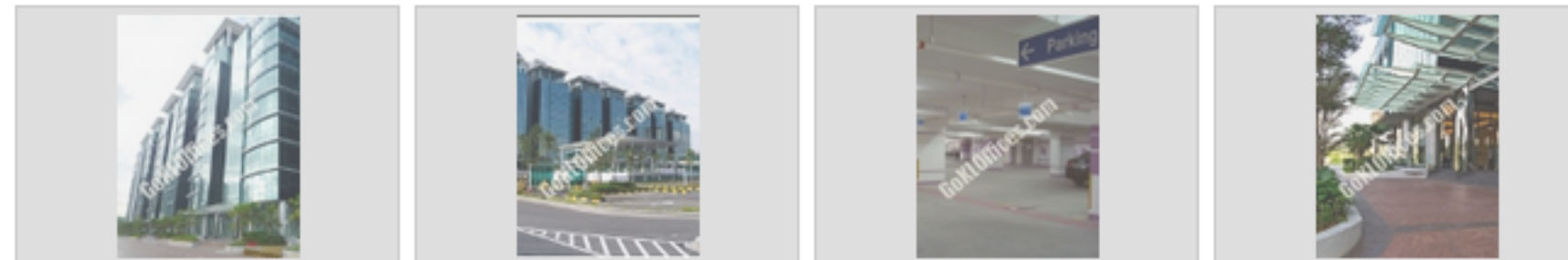
Image Gallery for The Horizon, Bangsar South, Bangsar