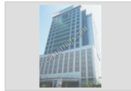
Image Gallery for Wisma Sunway, Section 9, Shah Alam